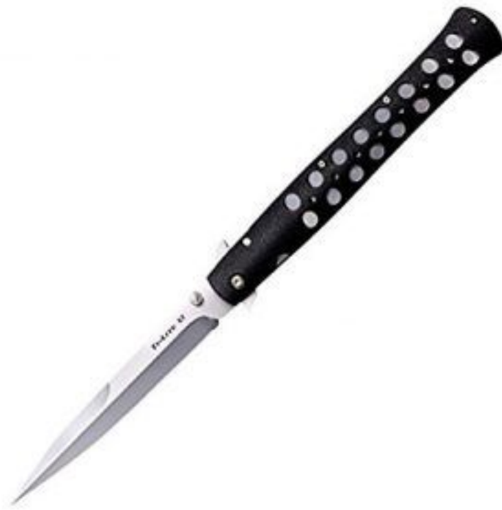
Cold Steel Ti-Lite XL ( Amazon )

Large Folding Knives have a blade length of 4 inches or above. They usually are pretty robust and made of stronger materials with beefy locks. This is because large folding knives are typically designed to complete heavy cutting tasks. Also, many manufacturers design large folding knives as self-defense knives. Now, I personally would NEVER advocate anyone to use a knife for self-defense, but I understand that it is a huge market. If you are looking to buy a knife for self-defense, I recommend you look at other options such as pepper spray or firearms. However, there are many large folding knives that work great for camping uses such as splitting firewood.