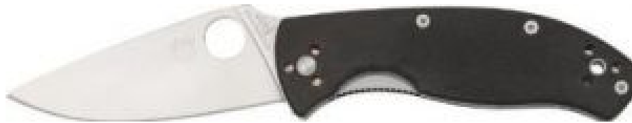
Spyderco Tenacious ( Amazon )

Medium Folding Knives have a blade length of at least 2.75 inches all the way to 4 inches. These blades tend to be the most popular as they can be very versatile. Being a good median between a large folding knife and a small folding knife allows for the best of both categories in some cases. While you may not get a massive blade, you can still have a fully functional knife while also having it be lightweight. Of course, all of this depends on the actual knife, but for the most part medium sized folding knives are going to be lighter than large folding knives. Medium folding knives are the sweet spot of folding knives for those who just want a blade that can do everything. Many believe medium sized folding knives are the best folding knife type that you can buy.