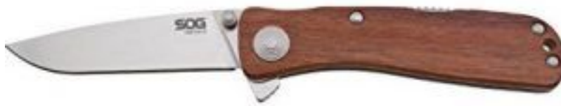
SOG Twitch 2 ( Amazon )

Small Folding Knives are knives with a blade length of 2.75 inches or smaller. While it may seem as though a small knife is useless, the fact that small knives can be extremely lightweight is a huge factor in choosing what to carry. If you have ever carried a large or XL folding knife every day, you may have noticed how annoying it can sometimes be to have a big heavy object in your pocket. Small knives mitigate that problem. In fact, many small folding knives are so lightweight, you forget that you are carrying them. However, the huge drawbacks to many small folding knives is that they have tiny handles and short blades. The tiny handles can make it difficult to cut through denser materials such as wood or plastic, while the small blade length limits you as to what you can cut. Fortunately, small folding knives make great EDC (Every Day Carry) knives and are excellent for cutting food, opening packages, and other daily tasks.